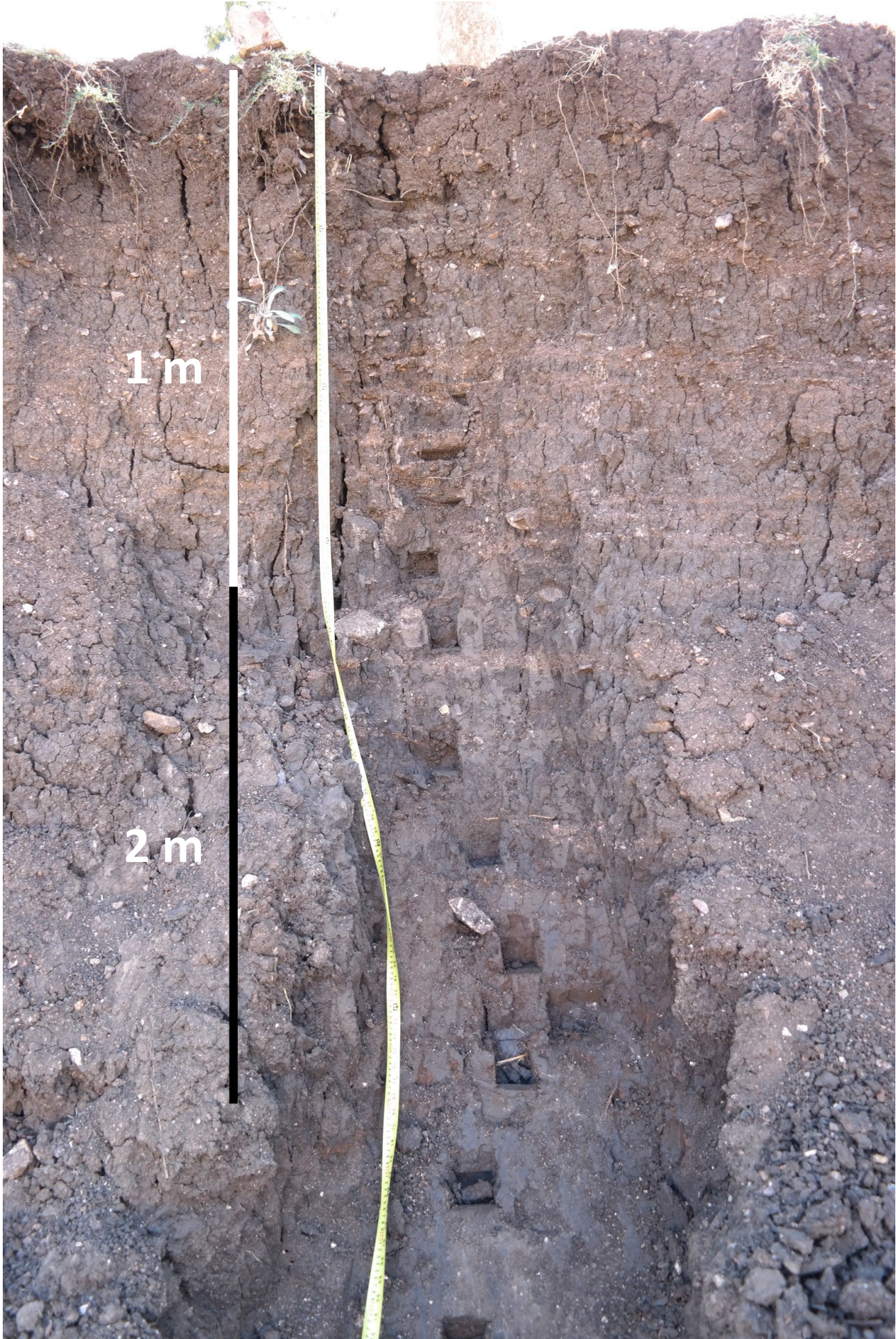
Photograph of section PG1 – upper part